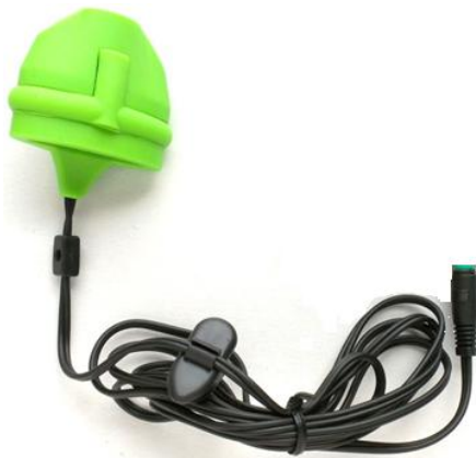
Figure3 Pulse Sensor

The Easy Pulse sensor is based on the principle of photoplethysmography (PPG) which is a non-invasive method of measuring the variation in blood volume in tissues using a light source and a detector. Since the blood change volume is proportional or synchronous to the heart beat, we can use this technique to calculate the heart rate. Reflectance & Transmittance and are two basic types of photoplethysmography.