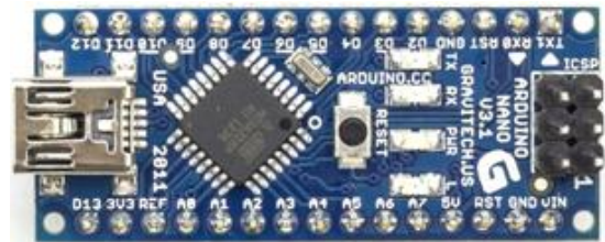
Figure2 Arduino Nano